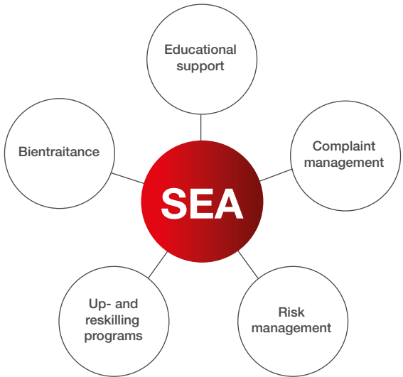
Quality at the heart of our approach.

Our goal, in collaboration with parents and municipalities, is to guarantee and continuously improve the quality of care for all children entrusted to us. To achieve this goal, our Education and Care Services (SEAS) have established active coordination in various areas of activity.