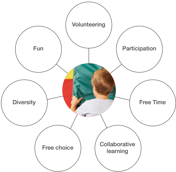
Our educational principles

Non-formal education views children as competent individuals. These educational approaches support them in their development, according to their needs and individual rhythm. The indoor and outdoor spaces in our facilities, as well as our play and learning materials, are selected and adapted to the needs and interests of the child.