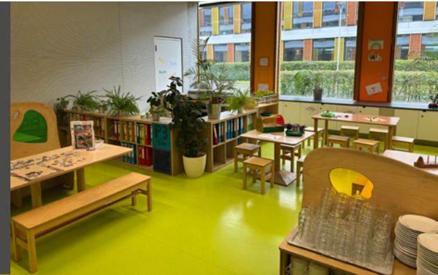
Restaurant of the Primary

In our open Maison Relais, it is important to us that children have a voice and can actively participate in daily life. They help shape their day, whether during meals, playtime, projects, or when choosing activities. We take their ideas seriously and involve them in decisions, such as room design, rules, or joint activities. This helps children learn to take responsibility, express their opinions, and see themselves as an important part of the community. Participation strengthens self-confidence and promotes respectful interaction.