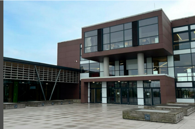
The Maison Relais