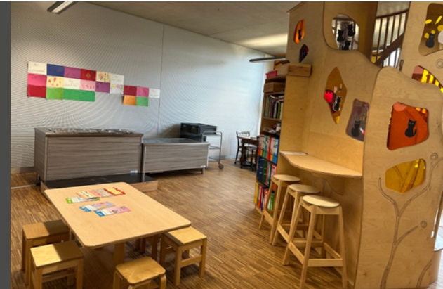
Restaurant of the Kindergarten

In an open Maison Relais, educators accompany children in a respectful and individualised manner. At the heart of their work is a trusting relationship that fosters independence and free development. Through observation and reflection, they provide targeted support to promote children’s development. Spaces and activities are tailored to the children’s needs and encourage creative play. Collaboration with parents and within the team is transparent and cooperative. Participation and values education are central components: children experience democratic principles in everyday life. The pedagogical approach is characterised by openness, reflection, and respectful guidance.