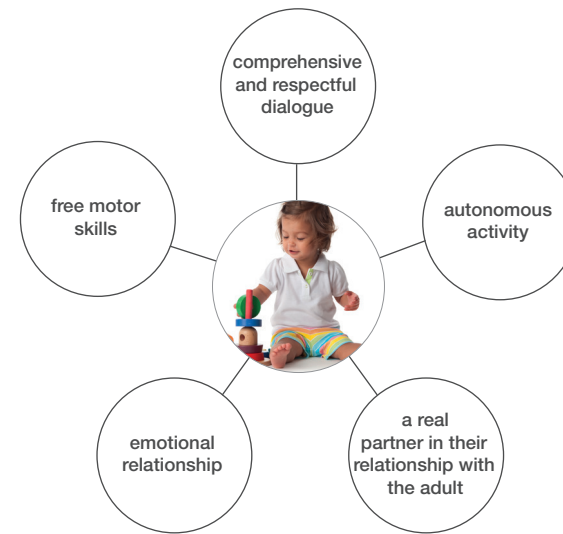
Our educational priorities

All children are unique individuals with the capacity to develop their potential. Our daily work in nurseries is based on the pedagogical approach of paediatrician Emmi Pikler (1902-1984). The founding principles of this approach are dialogue with the child, spatial arrangement, seamless continuity in caregiving, free motor skills, and autonomous play.