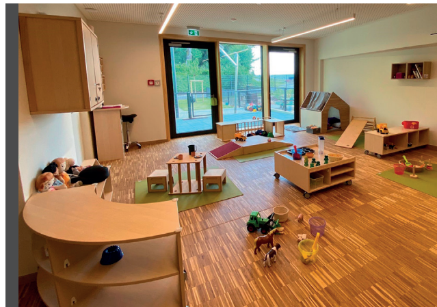
Area for free play options

Children’s free choice is essential to our work. When children are able to follow their interests, they will learn more. To achieve this, the child must find a well-prepared environment that supports their development and desires. Observing the children’s play is a significant part of our work, allowing us to respond appropriately and adjust the environment according to the children’s interests. For the child to develop their play freely and safely, the elements of this environment are always arranged in a consistent manner.