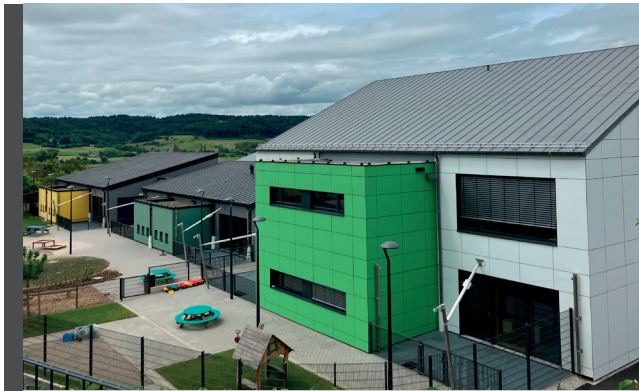
Zwergenhaus nursery Lorentzweiler