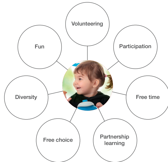
Our pedagogical principles

In 2016, the Ministry of Education, Children and Youth introduced a reference framework for non-formal education of children and young people through the Youth Law. It outlines the fundamental educational objectives as well as the principles and characteristics of non-formal education in Luxembourg. All our structures comply with these guidelines. Non-formal education views the child as a competent individual, with pedagogical approaches supporting their development according to their needs and pace. The indoor and outdoor spaces of our facilities, as well as our play and learning materials, are selected and adapted to the needs and interests of the children.