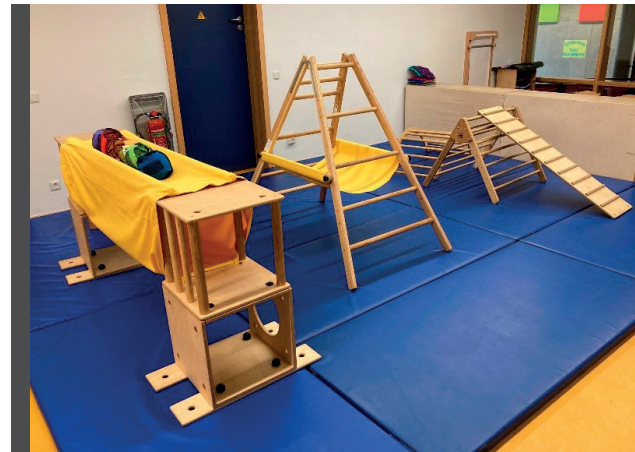
Motor skills space

As well as play, free motor skills is a key aspect of our pedagogy. We provide a spacious and safe area for children to move and develop at their own pace. It is important to us that young children discover and explore their own mobility through play, and we respect their developmental rhythm. This way, the children learn how to sit, stand, and take their first steps on their own, which reassures and encourages them in their development.