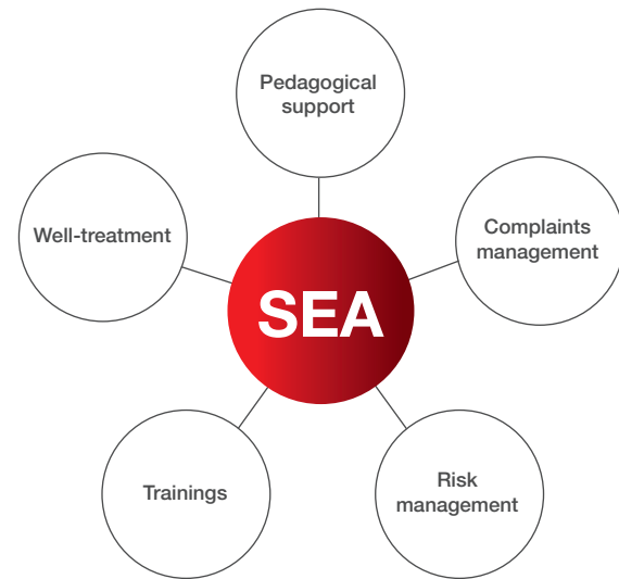
Quality at the heart of our approach

Our goal for parents and municipalities is to ensure and continuously improve the quality of support for all the children entrusted to us. To achieve this, our Education and Care Services ("Services d'Education et d'Accueil" – SEA) have established active coordination across various fields of action.