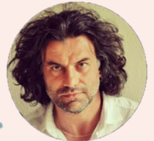
Fadi Painter Experimental Drawing