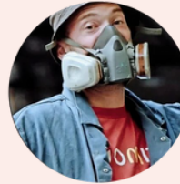
Stick Graffiti Artist Graffiti