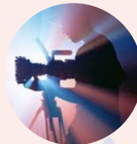
NoYa Videographie & Photographie